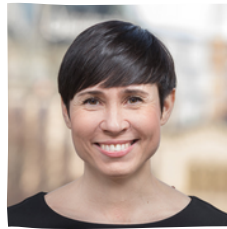
Ine Eriksen Soreide Minister of Foreign Affairs, Norway