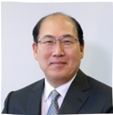
Kitack Lim Secretary General, IMO